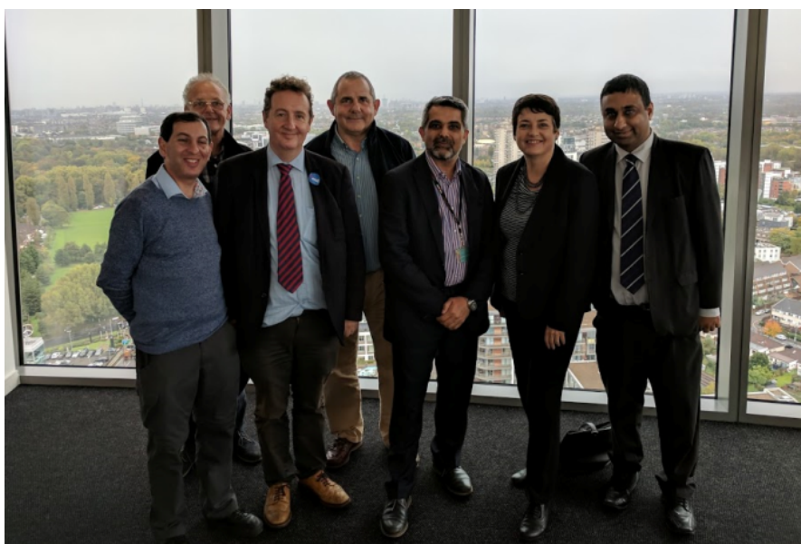
West London leaders and Val Shawcross, Deputy Mayor for Transport, meet in Brentford to discuss the Mayor's Transport Strategy and West London orbital rail, September 2017

We have engaged with over one hundred freight operators and businesses to develop a West London freight plan, which includes an action plan for the delivery of future projects. These include digitalising highway data for open access, looking at opportunities to consolidate freight in West London to free-up land without reducing subregional freight capacity.